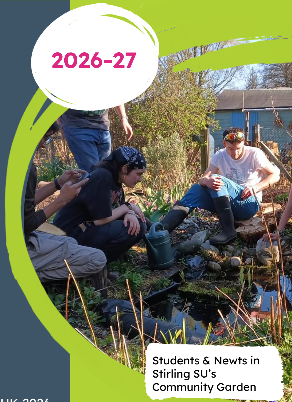
Students & Newts in Stirling SU's Community Garden