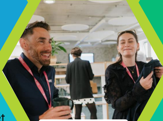
Isle of Wight awards

Staff understand what the organisation is doing on sustainability