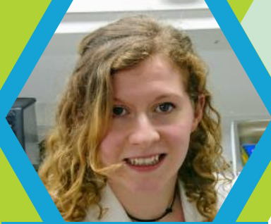
Senior Project Manager