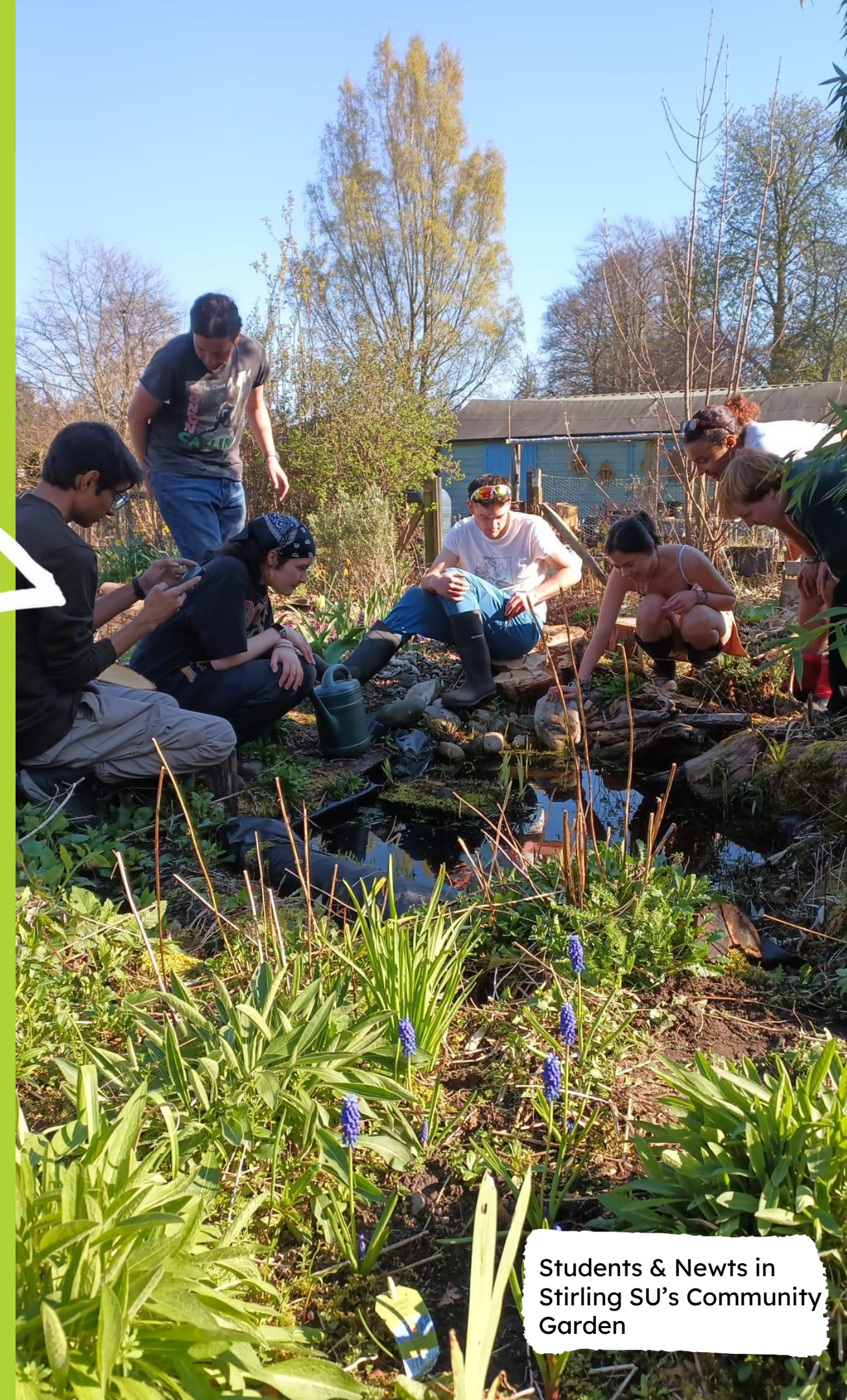
Students & Newts in Stirling SU's Community Garden

Join our community of Unions, Associations and Guilds working towards a fairer world where we protect nature and the climate!