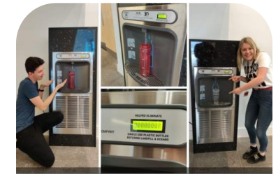
Undeb Bangor More water fountains around site is something that was submitted to Undeb Bangor Ideas over two years ago and is something we've worked incredibly hard on and we are pleased to say that there ... See more